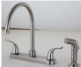
Item#ABP184260-1SN-S Hybrid waterway 8 inch center require 3 or 4 faucet hole to install 1.8 GPM flow rate at 60 psi 1/4 turn washerless cartridge Metal desk and handle Optional with or without spray Satin nickel finish UPC & CUPC Lead free certificated