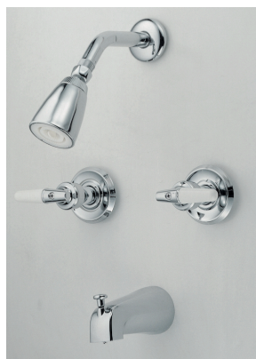
Item#162033C Brass waterway 2.2 GPM flow rate at 60 psi 1/4 turn washerless cartridge Metal desk and ABS handle lever ABS Shower head Chrome finish UPC & CUPC