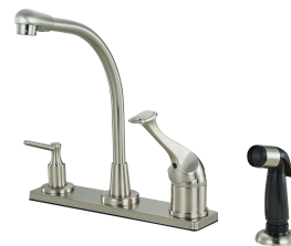
Item#AB183125SN-S Brass waterway 8 inch center require 3 or 4 faucet hole to install 1.8 GPM flow rate at 60 psi S.S ball valve Metal desk and handle Soap dispenser included Optional with or without spray Satin nickel finish UPC & CUPC Lead free certificated