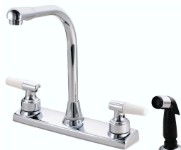
Item#ABM183131C-S Hybrid waterway 8 inch center require 3 or 4 faucet hole to install 1.8 GPM flow rate at 60 psi 1/4 turn washerless cartridge Metal desk and ABS handle lever Optional with or without spray Chrome finish UPC & CUPC Lead free certificated