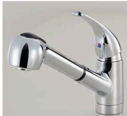
Item#AB190042C Brass waterway with S.S supply lines Pull-out spray require 1 faucet hole to install 1.8 GPM flow rate at 60 psi S.S ball valve Metal desk and handle ABS spray Chrome finish UPC & CUPC Lead free certificated