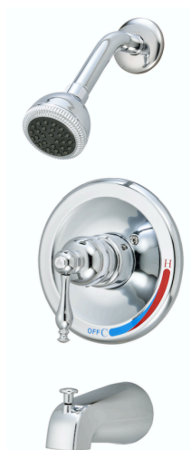
Item#261P040C Brass waterway Pressure Balance Valve 2.2 GPM flow rate at 60 psi Ceramic disc valve Metal desk and handle ABS Shower head Chrome finish UPC & CUPC