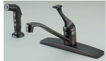
Item#ABP1701220B-S Hybrid waterway 8 inch center require 3 or 4 faucet hole to install 1.8 GPM flow rate at 60 psi S.S ball valve Metal desk and handle Optional with or without spray Oil Rubbed Bronze finish UPC & CUPC Lead free certificated