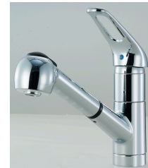
Item#AB290041C Brass waterway with S.S supply lines Pull-out spray require 1 faucet hole to install 1.8 GPM flow rate at 60 psi Ceramic disc valve Metal desk and handle ABS spray Chrome finish UPC & CUPC Lead free certificated