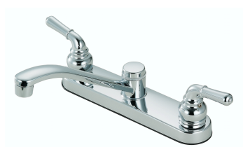
Item#ABM180260C Hybrid waterway 8 inch center require 3 or 4 faucet hole to install 1.8 GPM flow rate at 60 psi 1/4 turn washerless cartridge Metal desk and ABS handle Optional with or without spray Chrome finish UPC & CUPC Lead free certificated