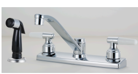
Item#ABM180131C-S Hybrid waterway 8 inch center require 3 or 4 faucet hole to install 1.8 GPM flow rate at 60 psi 1/4 turn washerless cartridge Metal desk and ABS handle lever Optional with or without spray Chrome finish UPC & CUPC Lead free certificated