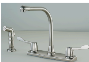
Item#ABM183119SN-S Hybrid waterway 8 inch center require 3 or 4 faucet hole to install 1.8 GPM flow rate at 60 psi 1/4 turn washerless cartridge Metal desk and handle Optional with or without spray Satin nickel finish UPC & CUPC Lead free certificated