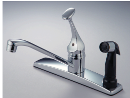
Item#ABP170124C-S Hybrid waterway 8 inch center require 3 faucet hole to install 1.8 GPM flow rate at 60 psi S.S ball valve Metal desk and handle Optional with or without spray Chrome finish UPC & CUPC Lead free certificated