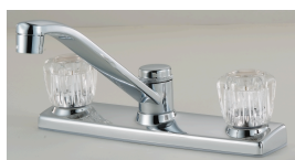
Item#ABP180101C Hybrid waterway 8 inch center require 3 or 4 faucet hole to install 1.8 GPM flow rate at 60 psi 1/4 turn washerless cartridge Metal desk and Acrylic handle lever Optional with or without spray Chrome finish UPC & CUPC Lead free certificated