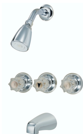
Item#163001C Brass waterway 2.2 GPM flow rate at 60 psi 1/4 turn washerless cartridge Metal desk and Acrylic handle ABS Shower head Chrome finish UPC & CUPC