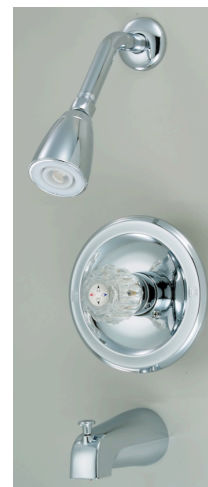
Item#161001C Brass waterway 2.2 GPM flow rate at 60 psi S.S ball valve Metal desk and Acrylic handle ABS Shower head Satin nickle finish UPC & CUPC