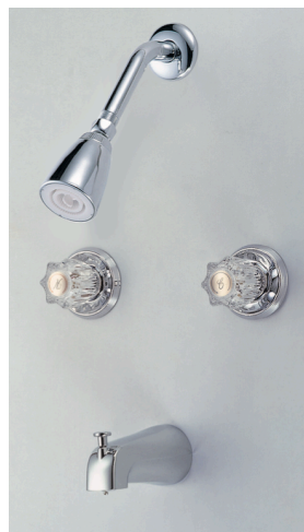
Item#162001C Brass waterway 2.2 GPM flow rate at 60 psi 1/4 turn washerless cartridge Metal desk and Acrylic handle ABS Shower head Chrome finish UPC & CUPC