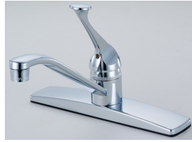
Item#ABP170121C Hybrid waterway 8 inch center require 3 or 4 faucet hole to install 1.8 GPM flow rate at 60 psi S.S ball valve Metal desk and handle Optional with or without spray Chrome finish UPC & CUPC Lead free certificated