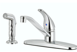
Item#ABP170241-1C-S Hybrid waterway 8 inch center require 3 or 4 faucet hole to install 1.8 GPM flow rate at 60 psi S.S ball valve Metal desk and handle Optional with or without spray Chrome finish UPC & CUPC Lead free certificated