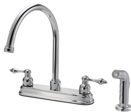
Item#ABP184340C-S Hybrid waterway 8 inch center require 3 or 4 faucet hole to install 1.8 GPM flow rate at 60 psi 1/4 turn washerless cartridge Metal desk and handle Optional with or without spray Chrome finish UPC & CUPC Lead free certificated