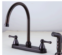
Item#ABP184241-1OB-S Hybrid waterway 8 inch center require 3 or 4 faucet hole to install 1.8 GPM flow rate at 60 psi 1/4 turn washerless cartridge Metal desk and handle Optional with or without spray Oil Rubbed Bronze finish UPC & CUPC Lead free certificated