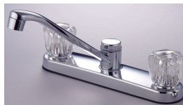
Item#ABM180201C Hybrid waterway 8 inch center require 3 or 4 faucet hole to install 1.8 GPM flow rate at 60 psi 1/4 turn washerless cartridge Metal desk and Acrylic handle Optional with or without spray Chrome finish UPC & CUPC Lead free certificated