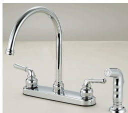
Item#ABP184260C-S Hybrid waterway 8 inch center require 3 or 4 faucet hole to install 1.8 GPM flow rate at 60 psi 1/4 turn washerless cartridge Metal desk and handle Optional with or without spray Chrome finish UPC & CUPC Lead free certificated