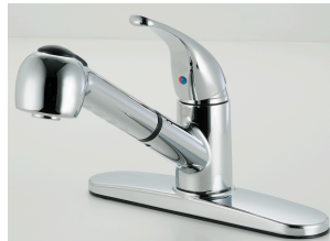
Item#AB190142C Brass waterway with S.S supply lines Pull-out spray require 3 faucet hole to install 1.8 GPM flow rate at 60 psi S.S ball valve Metal desk and handle ABS spray Chrome finish UPC & CUPC Lead free certificated