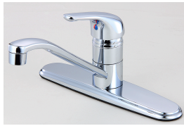
Item#AB270241-1C Brass waterway 8 inch center require 3 or 4 faucet hole to install 1.8 GPM flow rate at 60 psi Ceramic disc valve Metal desk and handle Optional with or without spray Chrome finish UPC & CUPC Lead free certificated