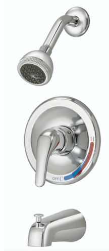
Item#261P025SN Brass waterway Pressure Balance Valve 2.2 GPM flow rate at 60 psi Ceramic disc valve Metal desk and handle ABS Shower head Satin nickle finish UPC & CUPC