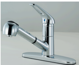
Item#AB290141C Brass waterway with S.S supply lines Pull-out spray require 1 faucet hole to install 1.8 GPM flow rate at 60 psi Ceramic disc valve Metal desk and handle ABS spray Chrome finish UPC & CUPC Lead free certificated