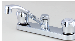
Item#ABM180202C Hybrid waterway 8 inch center require 3 or 4 faucet hole to install 1.8 GPM flow rate at 60 psi 1/4 turn washerless cartridge Metal desk and ABS handle Optional with or without spray Chrome finish UPC & CUPC Lead free certificated